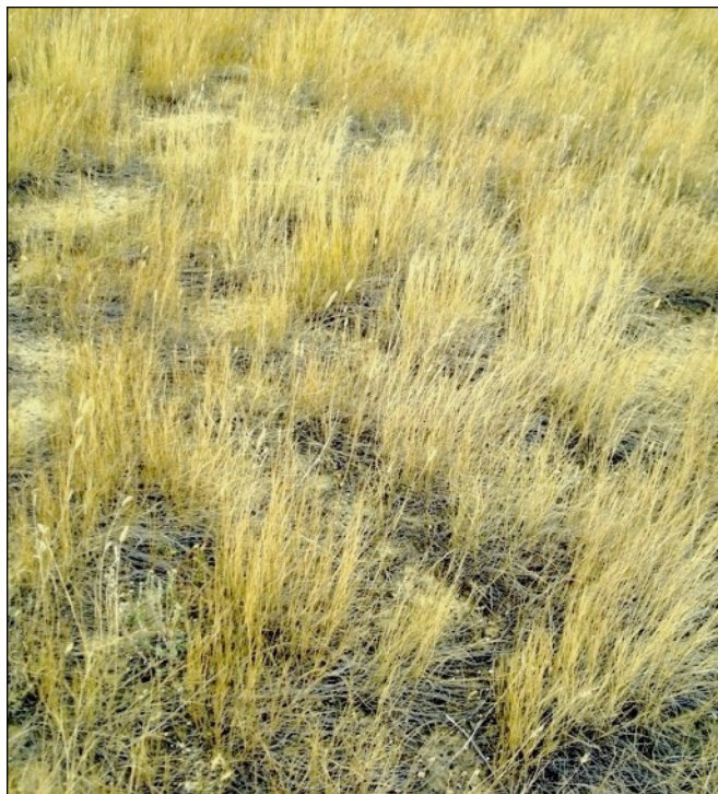
Photo 1b. A typical eastern Montana stand of Agropyron cristatum (crested wheatgrass) after several decades