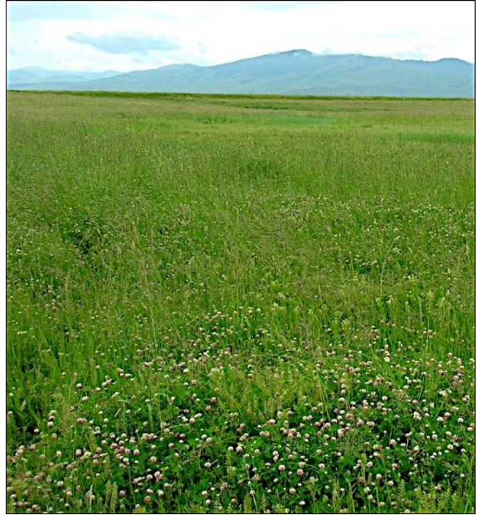
Photo 1d. Another seeded pasture/hay mix on an irrigated field