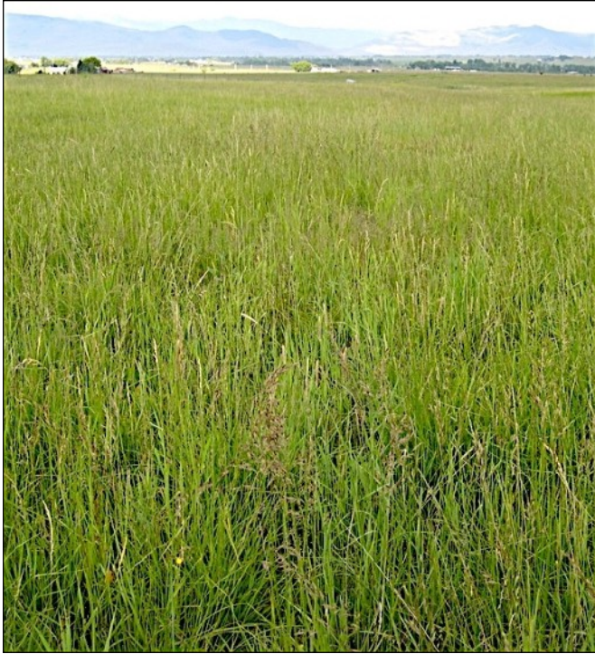
Photo 1c. A seeded pasture/hay mix on an irrigated field